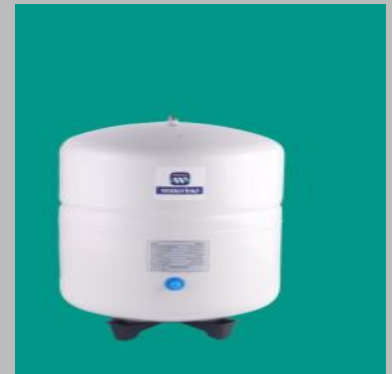
Waterino Reverse Osmosis Pressure Tank