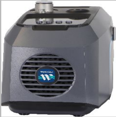
POWER SAVER HOME BOOSTER

We Waterino are a leading and distinguished Manufacturer, Exporter, Supplier and Retailer of quality Chemical Equipment, Chemical Reactors & Process Tanks, Coupling, Data Loggers and Drainage Product.