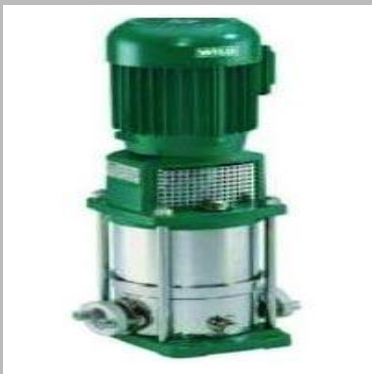
vertical multistage pump