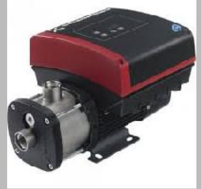
Horizontal Multistage Pump