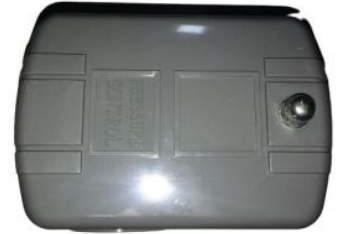
Differential Pressure Switches