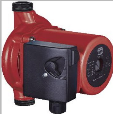
WB Series Inline Home Booster Water Pump