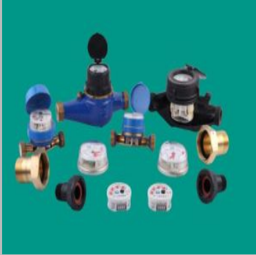
Woltman Water Meter