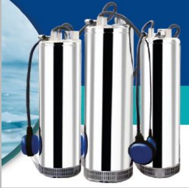
Multistage Closed Couple Bottom Suction Submersible Water Pump