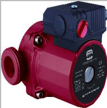
HWR Hot Water Circulation Water Pump