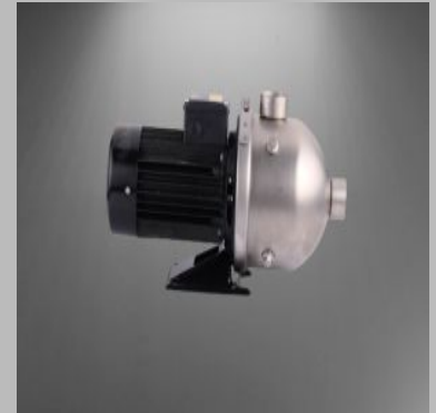
WHMS-WBI Horizontal Multistage Water Pump