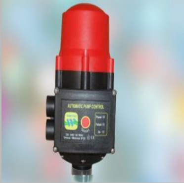
Pressure Control Switch