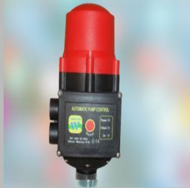
Electronic Pressure Controller Switches