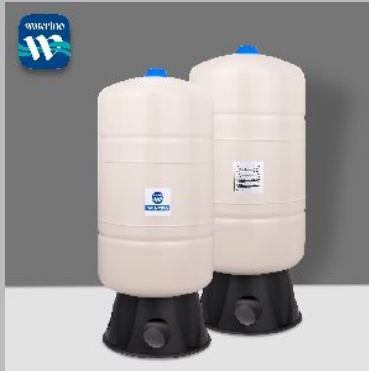
Waterino Fixed Diaphragm Pressure Tank