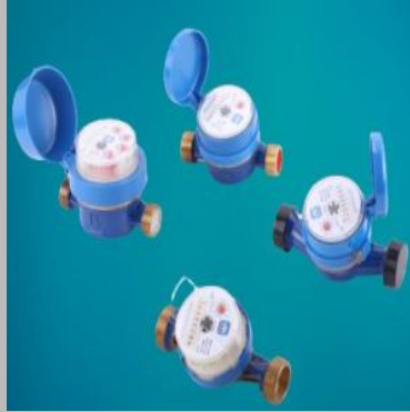
Single Jet Water Meter