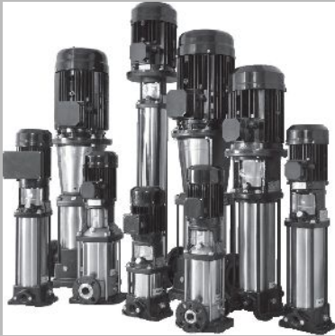
WVMS, WVMI Vertical Multistage Water Pump