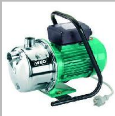
Pressure Boosting Pump