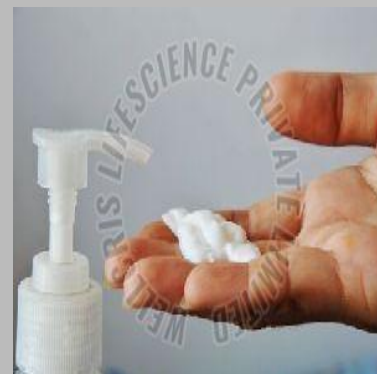
Clindamycin Phosphate Lotion