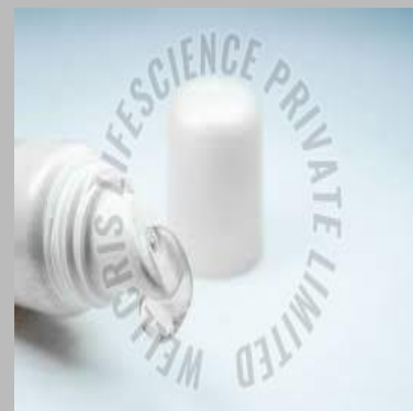
Fluoride Medicated Oral Gel