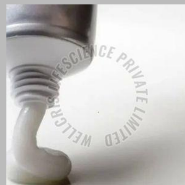
Mometasone Furoate & Fusidic Acid Cream