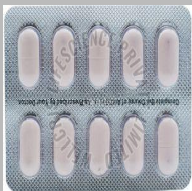
Levofloxacin 500mg Tablets