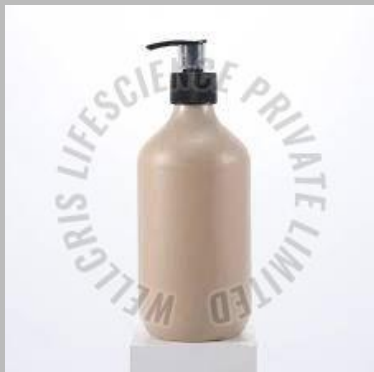
Sertaconazole Nitrate & Zinc Pyrithione Shampoo