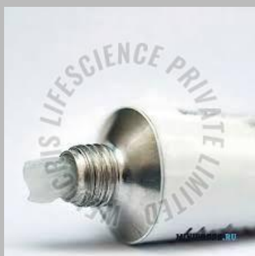
Chlorhexidine and Cetrimide Cream