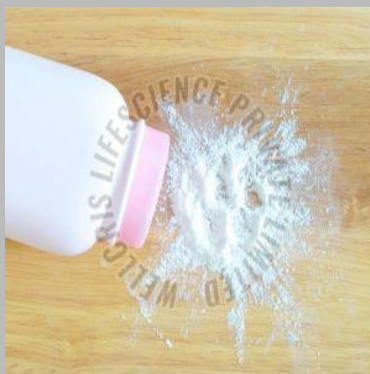
Terbinafine Hydrochloride Dusting Powder