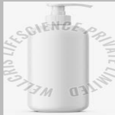
Ketoconazole & Coal Tar Shampoo