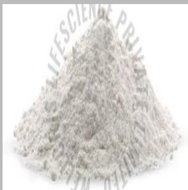
Sertaconazole Nitrate Dusting Powder