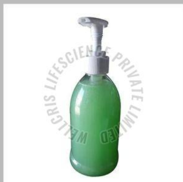
Chlorhexidine Gluconate Hand Wash

Wellcris Lifescience Private Limited is known as top Manufacturer, Exporter and Supplier of best Alcohol Solvents, Anti Cancer Medicine, Anti Infective Agent, Anti Infective API and Anti-itch Skin Cream.