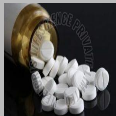
Ciprofloxacin 500mg Tablets