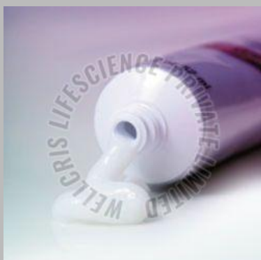
Tretinoin Clindamycin Gel