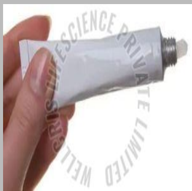
Sertaconazole Nitrate Gel