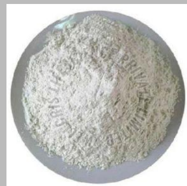
Sertaconazole Dusting Powder