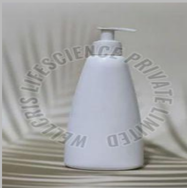
Ketoconazole & Zinc Pyrithione Shampoo