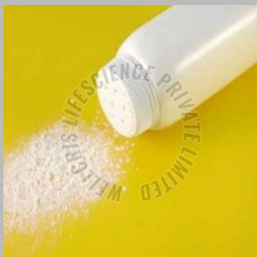
Sertaconazole Nitrate Topical Dusting Powder