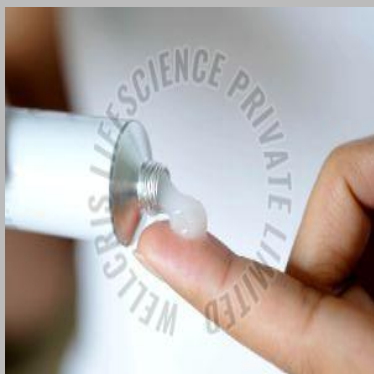
Tretinoin Microsphere Gel