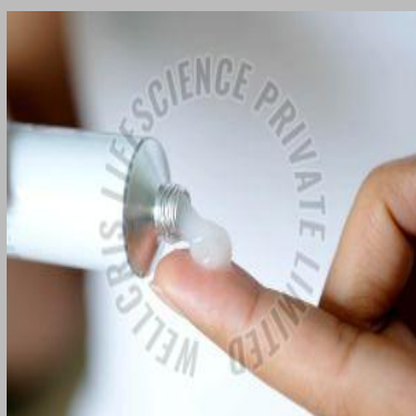
Betamethasone Dipropionate Cream