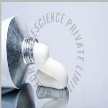
Sodium Monofluorophosphate Gel