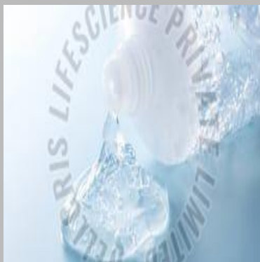
Potassium Nitrate Triclosan Gel