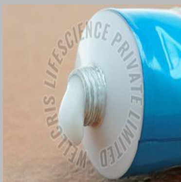
Fusidic Acid Cream