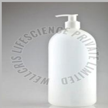
Terbinafine Hydrochloride Lotion