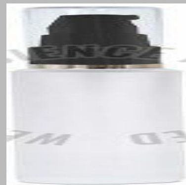
Sertaconazole Nitrate Lotion