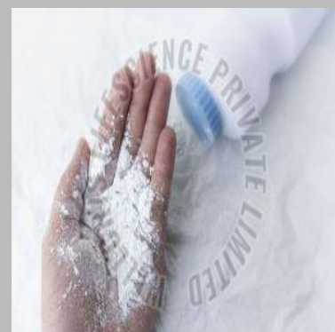
Ketoconazole Dusting Powder