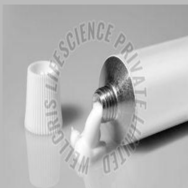
Betamethasone Dipropionate Ointment