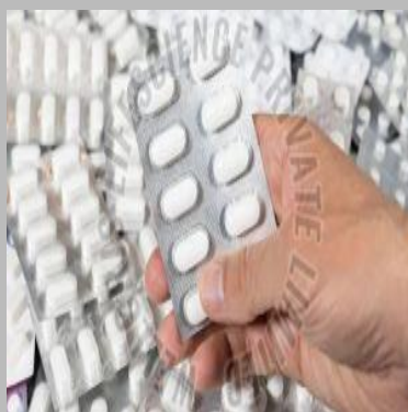
Segipod 200mg Tablet