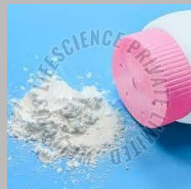
Luliconazole Dusting Powder