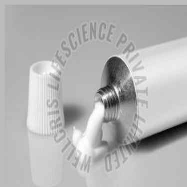
Ciclopirox Olamine Cream