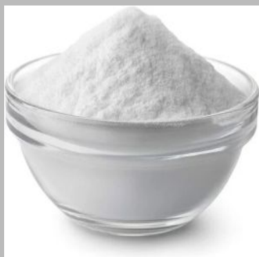
6-Acetyl Amino-2-Amino Phenol-4-sulfonic Acid