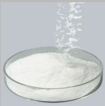
P-Phenylene Diamine-2- Sulfonic Acid