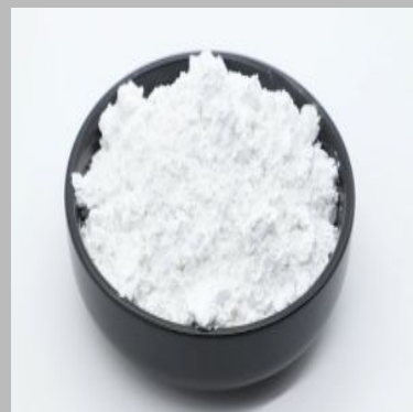
Para Nitro Chloro Benzene Ortho Sulfonic Acid