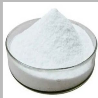
P-Anisidine 2:5 Disulphonic Acid