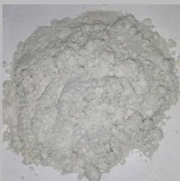
Acetyl MPDSA Powder