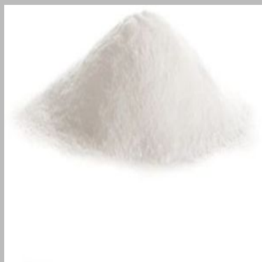
Para Phenylene Diamine 2,5 Disulfonic Acid