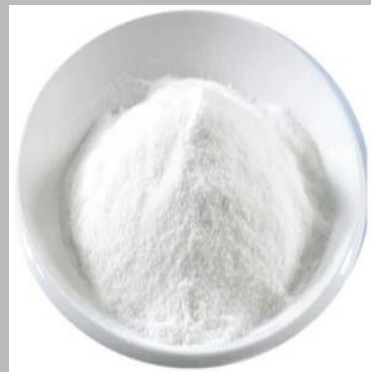
4 Amino Benzene Sulfanilamide Powder