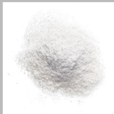
Para Anisidine Ortho Sulphonic Acid