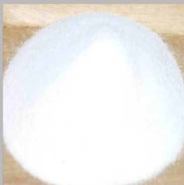
Para Toluidine 2 -5 Disulphonic Acid