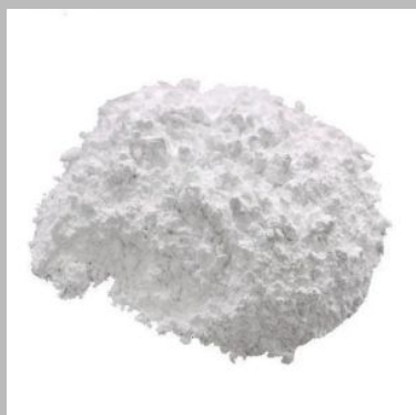
Para-Amino Azobenzene 4 Sulfonic Acid Powder