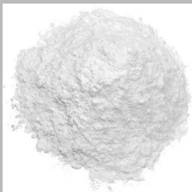
Sulfo OAVS 5 Sulfonyl 1