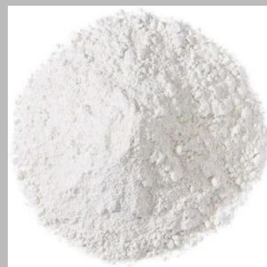
4 Nitro 2 Amino Phenol 6 Sulfonic Acid