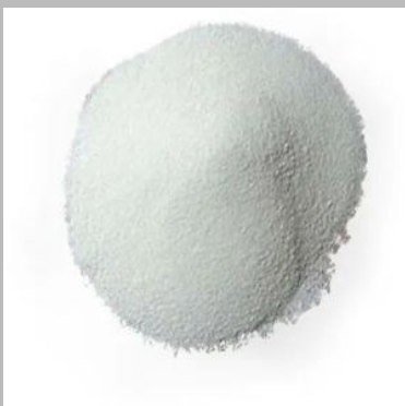
6 Chloro 2 Amino Phenol 4 Sulfonic Acid