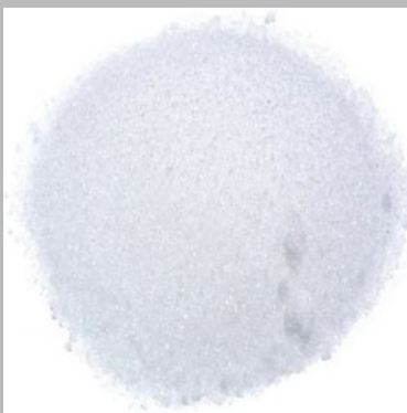
Para Phenylene Di Amine Sulphate