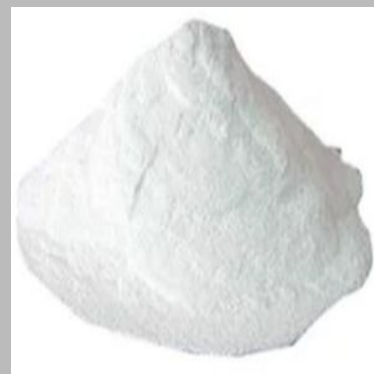
6-Nitro-2-Aminophenol-4- Sulfonic Acid