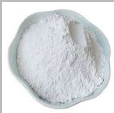
Ortho Nitro Chloro Benzene-4-Sulfonic Acid