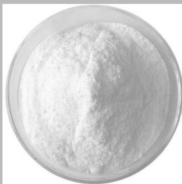
N Acetyl Benzylamine Acid Powder