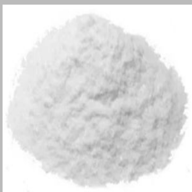
Chlorpheniramine-4,11- disulfonic Acid