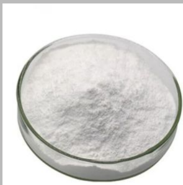
Ortho Amino Phenol-4- Sulfonic Acid