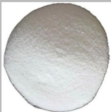
6 Chloro 2 Aminophenol-4 Nitrophenol