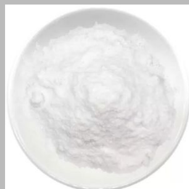
6 Nitro 4 Chloro 2 Aminophenol