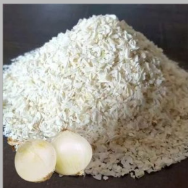
Dehydrated White Onion Chopped