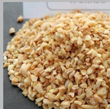
Dehydrated Garlic Chopped