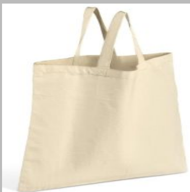
Plain Cotton Bag