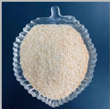
Dehydrated White Onion Minced