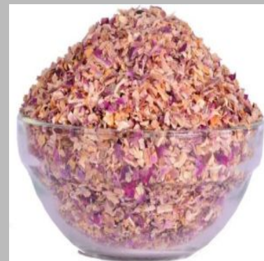
Dehydrated Red Onion Chopped