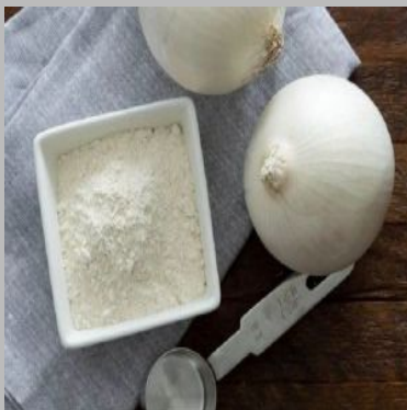
Dehydrated White Onion Powder