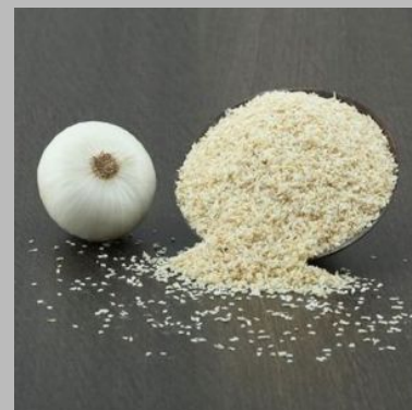
Dehydrated White Onion Granules