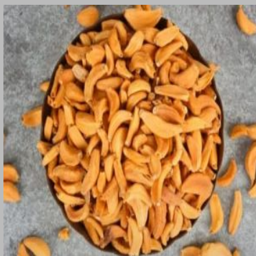
Dehydrated Garlic Flakes