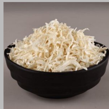
Dehydrated White Onion Flakes