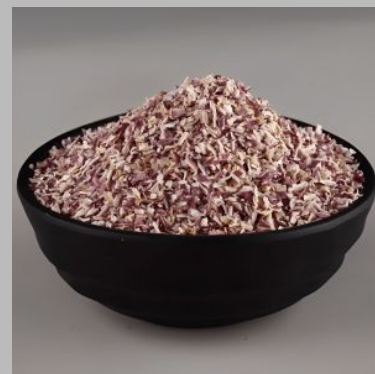
Dehydrated Red Onion Minced