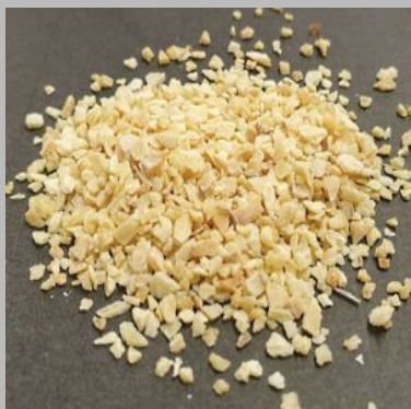
Dehydrated Garlic Minced