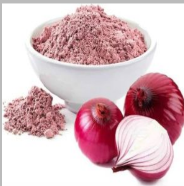
Dehydrated Red Onion Powder