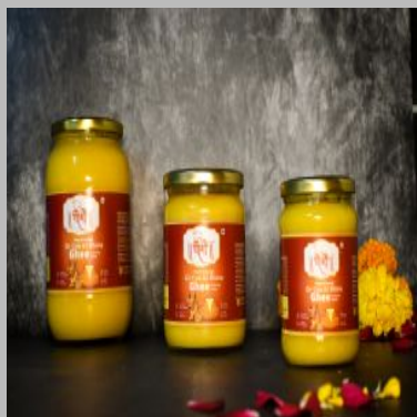
Yogi A2 Cow Ghee

We Yogi Enterprise are a leading and distinguished Manufacturer, Exporter, Supplier and Trader of quality Chopped Onion, Cotton Bags, Dairy Products, Dehydrated Garlic and Dehydrated Onion.